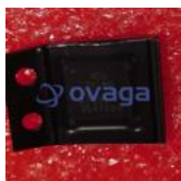
ADV7391WBCPZ Analog Devices, Inc LFSCP-3