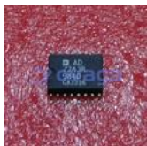
AD724JR Analog Devices, Inc SOIC-16