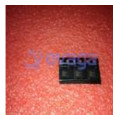
ADV7390BCPZ Analog Devices, Inc QFN32