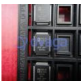
ADV7341BSTZ Analog Devices, Inc LQFP-64