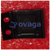
ADV7391WBCPZ Analog Devices, Inc LFSCP-3