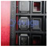
ADV7341BSTZ Analog Devices, Inc LQFP-64