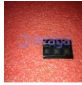
ADV7390BCPZ Analog Devices, Inc QFN32