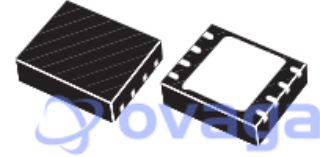
DFN8 (3 x 3 mm)