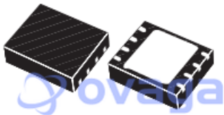
DFN8 (3 x 3 mm)

Ovaga has a large stock of STCS1APUR Power Management ICs from STMicroelectronics, Inc and we guarantee that they are original, brand new parts sourced directly from STMicroelectronics, Inc We can provide quality testing reports for STCS1APUR upon your request. To obtain a quote, simply fill in the required quantity, contact name, and email address in the quick quote form on the right. Our sales representative will contact you within 12 hours.