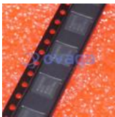
ADAS3022BCPZ Analog Devices, Inc LFCSP-40