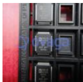
ADV7341BSTZ Analog Devices, Inc LQFP-64