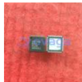
ADV7393BCPZ Analog Devices, Inc LFCSP-VQ-40